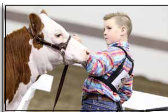
EF JACKIE CHEVELLE 3907 125G ET

Reserve Grand Champion at 2019 National Western Stock Show.