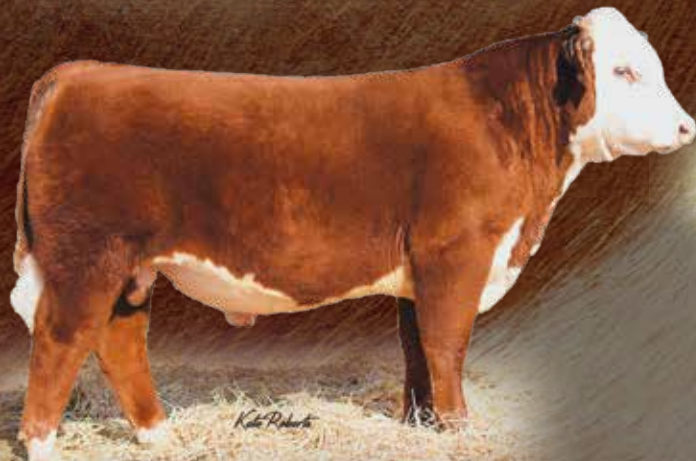
Churchill Nightcap 7256E