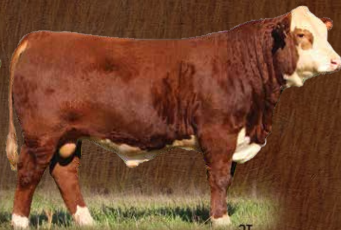
KCF Bennett Noble D367