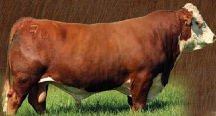
NJW 160B 028X Historic 81E