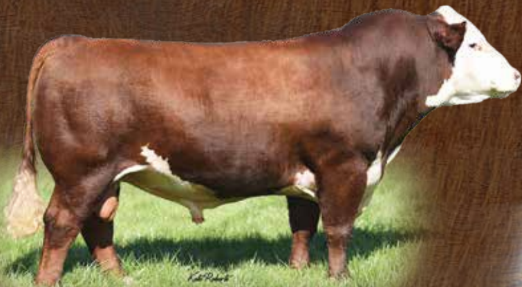
EFBEEF BR Validated B413