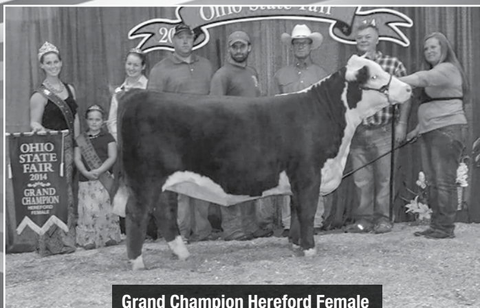
Grand Champion Hereford Female 2014 Ohio State Fair

Visitors always welcome! Cattle are for sale at all times Come see our cow herd