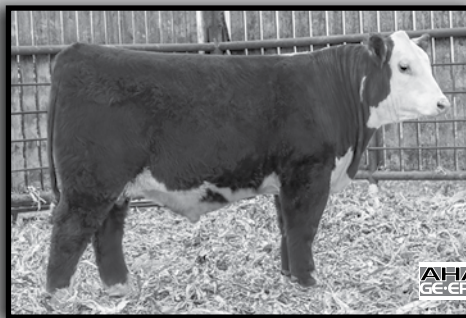
GERBER GRAZER G15 {DLF,HYF,IEF,MSUDF}

BULL P44100924 • Calved: 2/21/19 • Tattoo: LE G15/RE GRBR