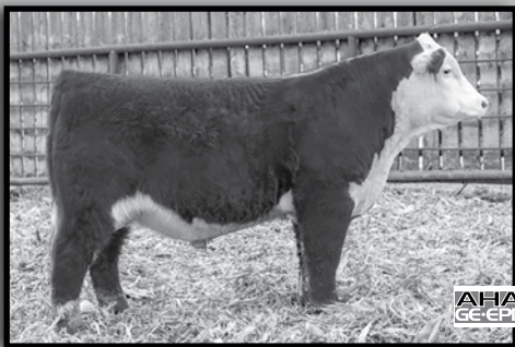
ELZE Z426 GILLETTE 8G {DLF,HYF,IEF,MSUDF}

BULL P44001380 • Calved: 3/24/19 • Tattoo: BE 8G