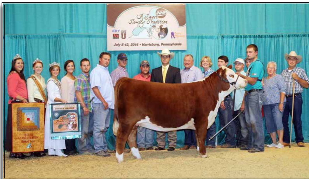
EF MONA CHEVELLE 907 3907

Plus embryos by Chevelle x Sensation 2296 and Chevelle x Montgomery for sale!