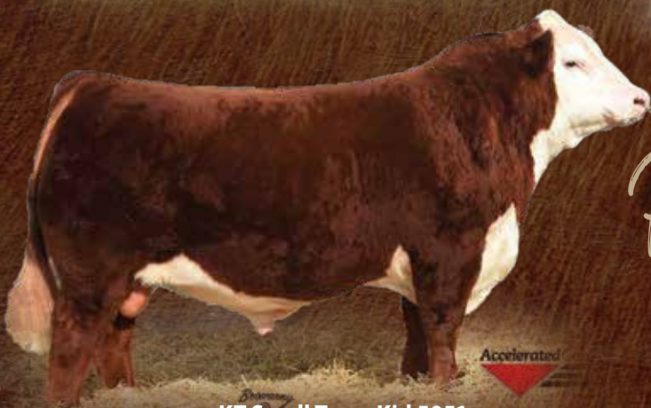
KT Small Town Kid 5051