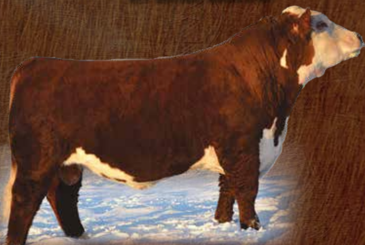
JDH Victor 719T 33Z ET