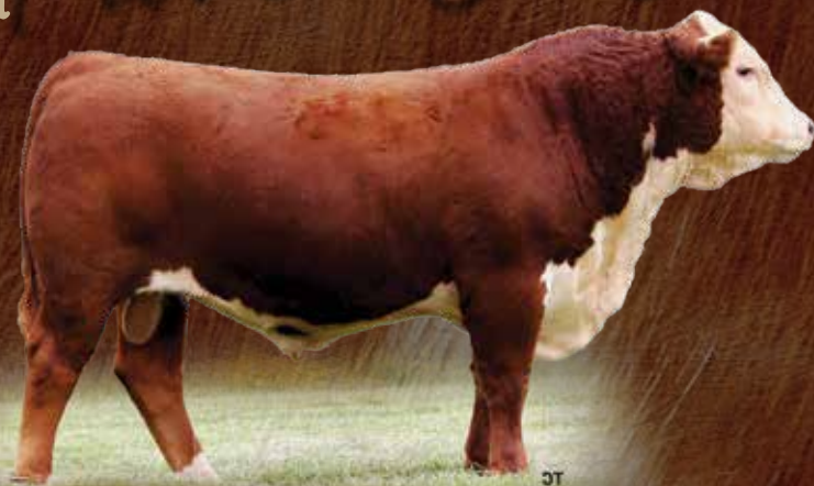
BEHM 100W Cuda 504C