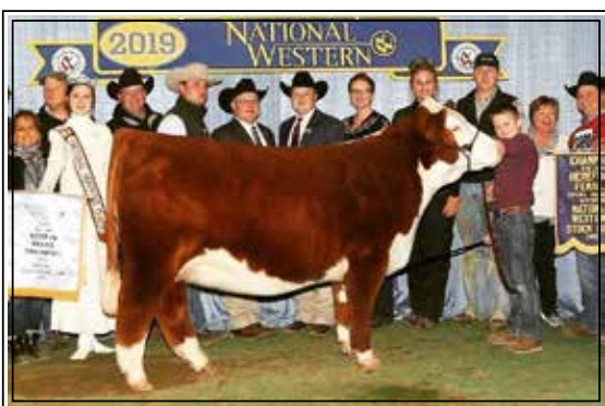
SC NOVA 04E ET

Reserve Grand Champion at 2019 National Western Stock Show.