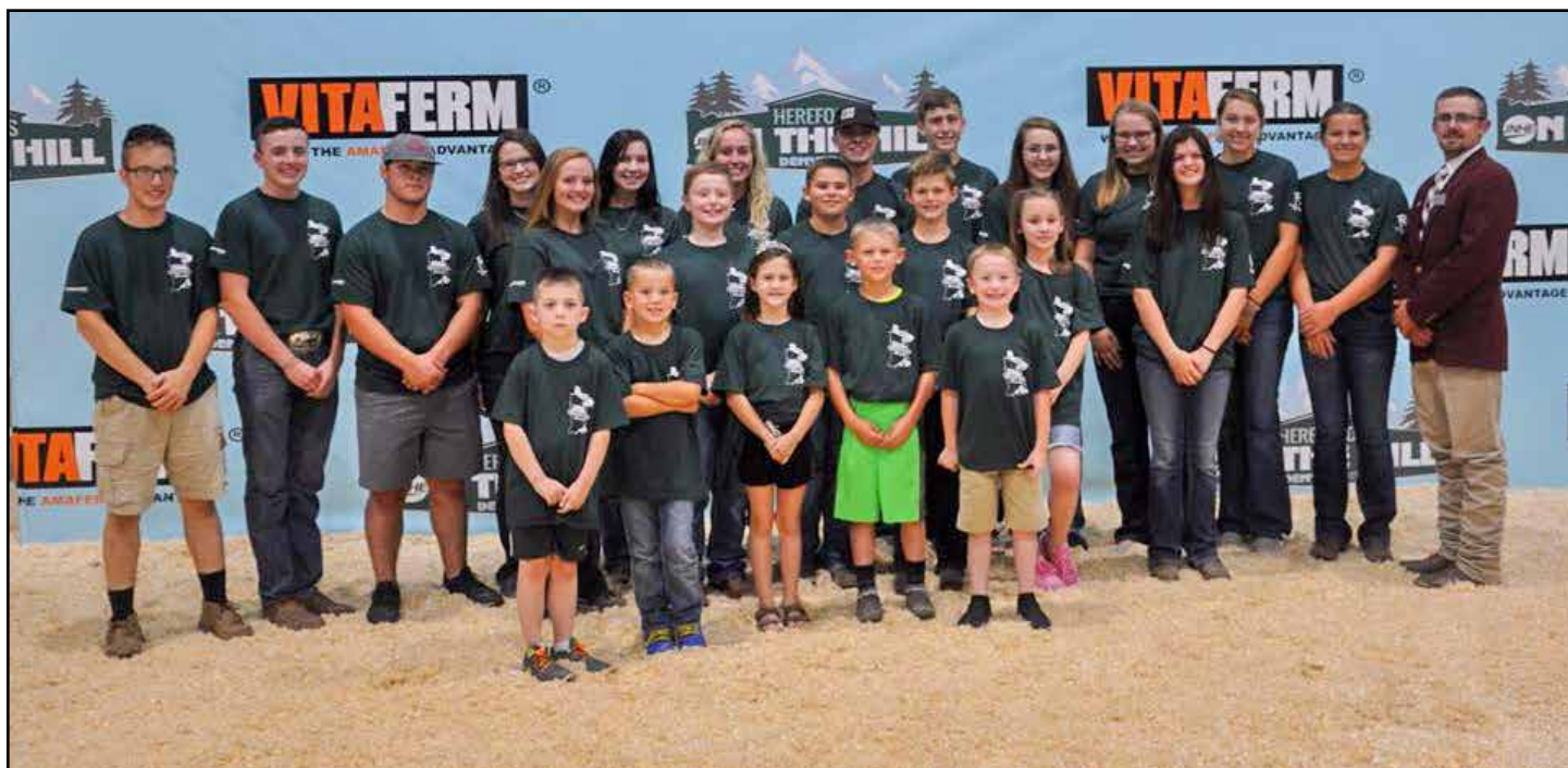
Indiana Junior Hereford Association — Junior National Hereford Expo 2019